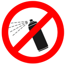
Verbot von Sprühdosen