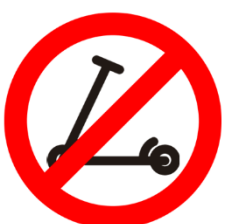
Verbot von E-Scootern/ Segways