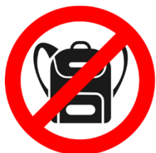
Verbot von Taschen über A4