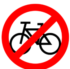
Verbot von Fahrrädern/ Skateboards