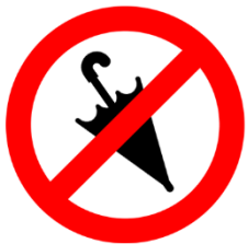
Verbot von sperrigen Gegenständen