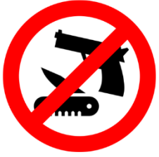
Verbot von Waffen aller Art

Please observe the following guidelines and regulations that have been established to ensure event safety, the avoidance of danger to persons, damage to property and a trouble-free and festive UEFA EURO 24 in the host city Munich.