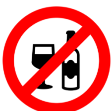
Verbot von Glas